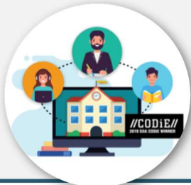
Flexible Curriculum Platform