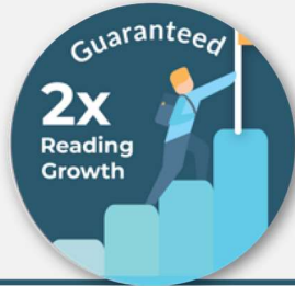
Guaranteed Learning Acceleration