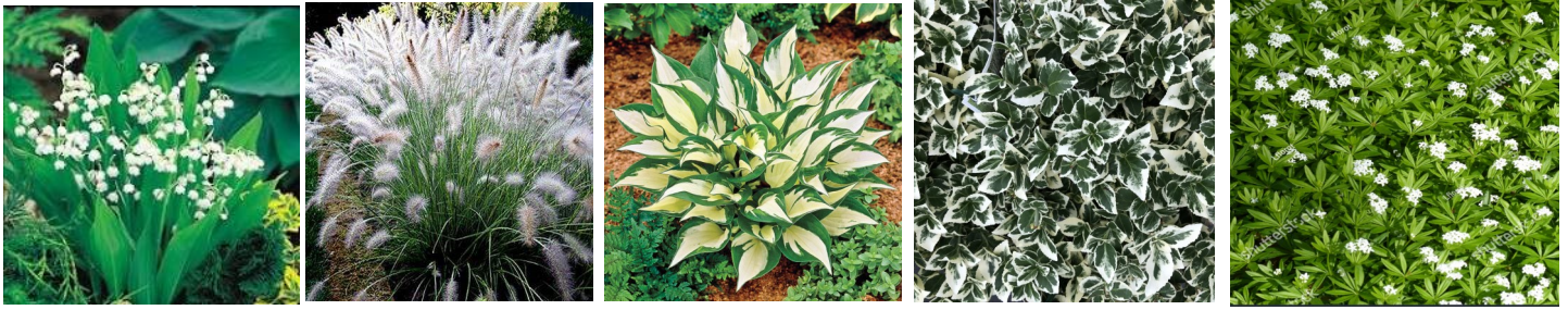
SUGGESTED PLANTINGS: Shade and drought tolerant. From left, Lillies of the Valley; Dwarf Fountain grass; Hosta; Euonymus Wintercreeper; Flowering Sweet woodruff.