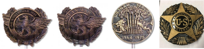
Flag Holders commemorating Gorton lives lost in WWII, Korea, Vietnam, Afghanistan