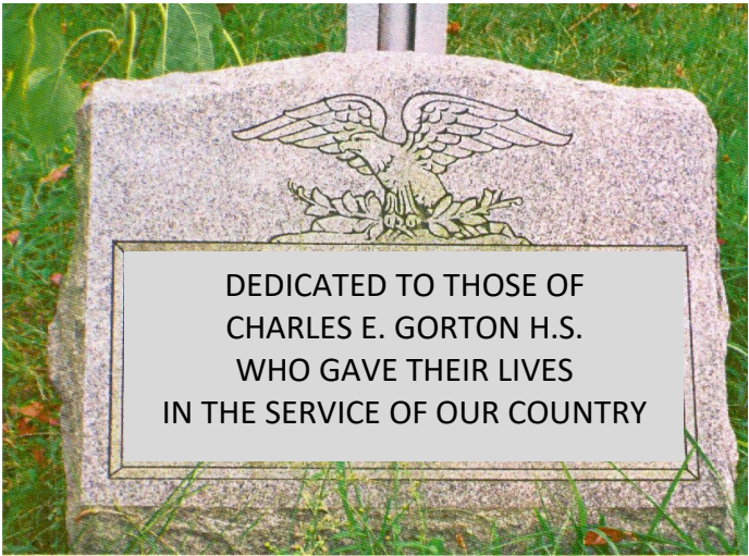
Suggested wording to the Gorton monument; design elements still under consideration. Monument measures 30 inches wide, 24 inches tall,