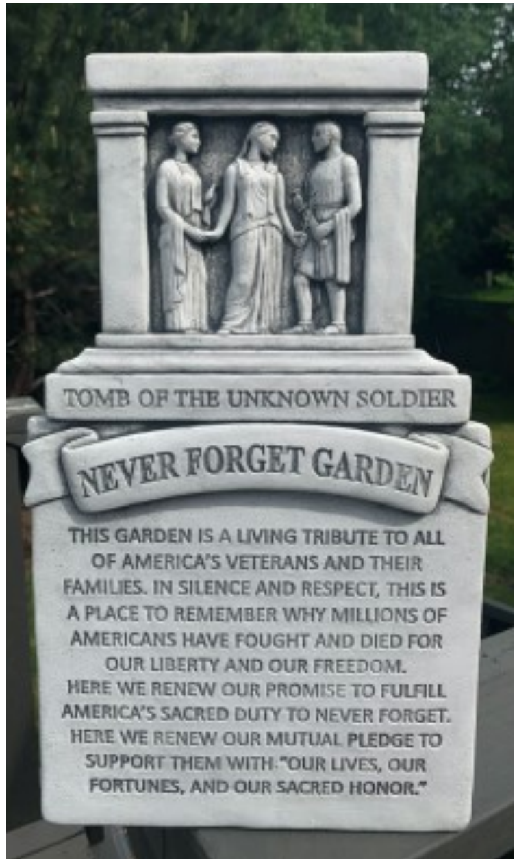
The marker is 11 x 17 and about ¾" minimal thickness. It can be attached to tree and will withstand any climate. Suggested placement: Facing Gorton, tree to the right.