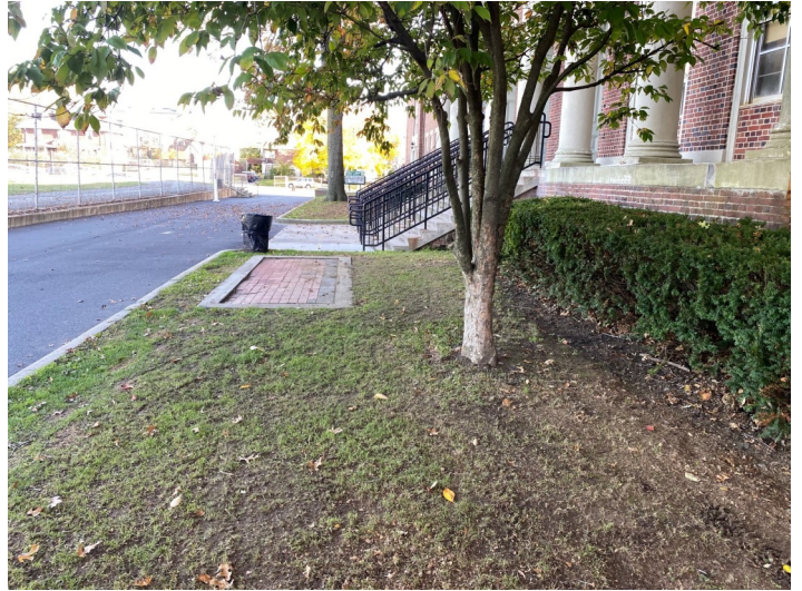
View of bricks and proposed garden from Palisades Avenue side