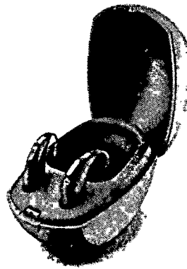
Phonak Mini Charger Case